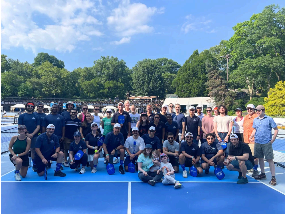
NineDotters playing pickleball in Central Park this June

Our team is still growing! NineDot is looking for people to join our fight for a clean energy future. Check out our website for current open roles .